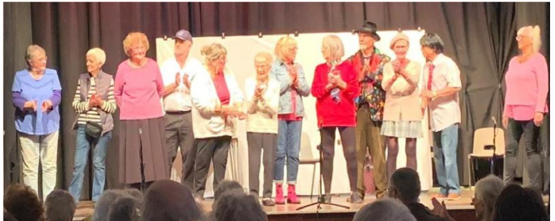
Curtain call for all members of the show