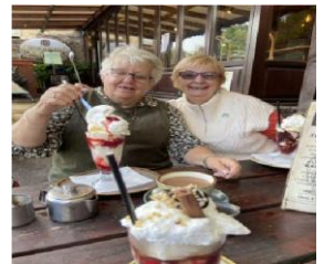
Enjoying summer delights during the Autumn!