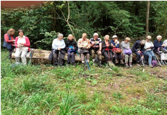
The group taking a breather at the halfway point near Winscombe

Although we have to be careful with numbers, it only takes a few stiles to slow us down and we have had as many as 36 on at least one walk. We are on the lookout for new blood especially if you have walking experience or know the area very well and can offer to lead walks.