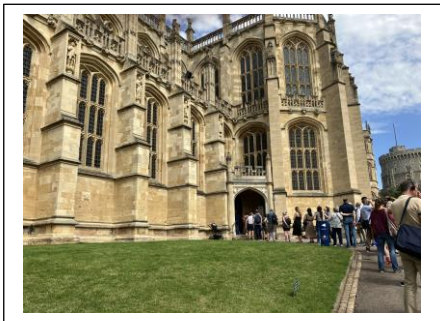
St. Georges Chapel

On the 10 th August Weston u3a organised a visit to Windsor Castle. It was a very hot and sunny day which turned out to be a great success. Such was the interest in this trip that we eventually had two fully loaded coaches with 98 passengers. Although the time in Windsor was obviously limited, most visitors were able to see inside St. Georges Chapel and observe the tomb of our late Queen Elizabeth II. The considered opinion amongst most of our travellers was that having witnessed her funeral on television, it was a privilege to visit the castle in reality.